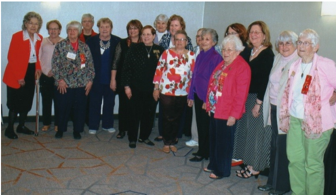
AKS Achievement Award Recipients