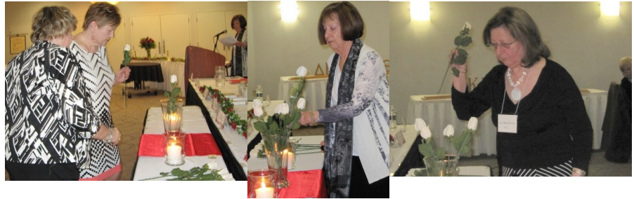
Ceremony of Remembrance